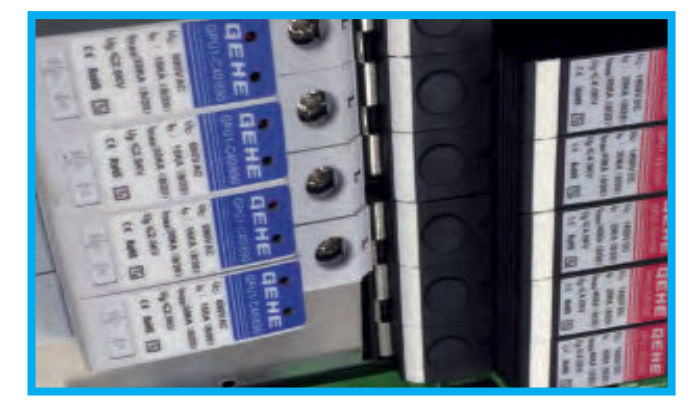
(Surge Protection Devices)